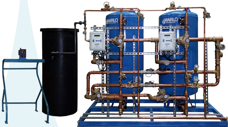
System shown with skid mount and copper piping options.